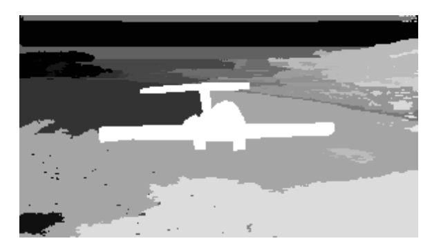
Region segmentation result.(b)Segmentation map of (a).